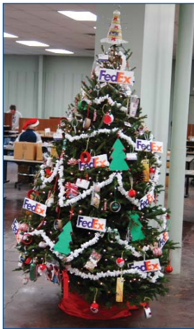
At left, the Alternative Vocational Services Division of Baddour Custom Packaging (BCP) created decorations for the Christmas tree. The decorations were made out of supplies used on BCP projects, such as garland from packing popcorn.