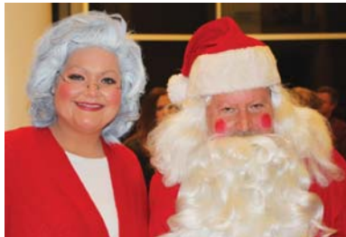
At left, Mrs. Claus and Santa Claus greet guests before the Christmas pageant began. They also concluded the Parade of Toys while The Miracles sang "Here Comes Santa Claus."